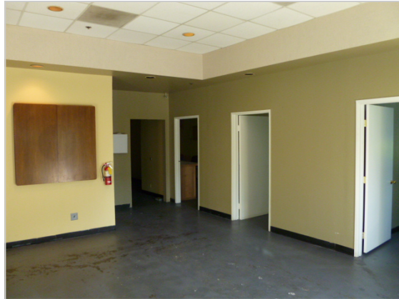
Two (2) private offices, workroom, kitchen and open office area.

Operational Food Commissary or Office/Warehouse Facility