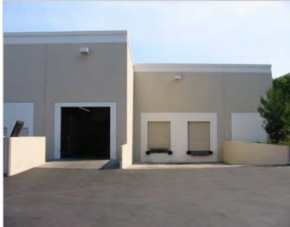
Ground Level Loading and Double Truck Well

20,500 SF Freestanding Office / Warehouse Building