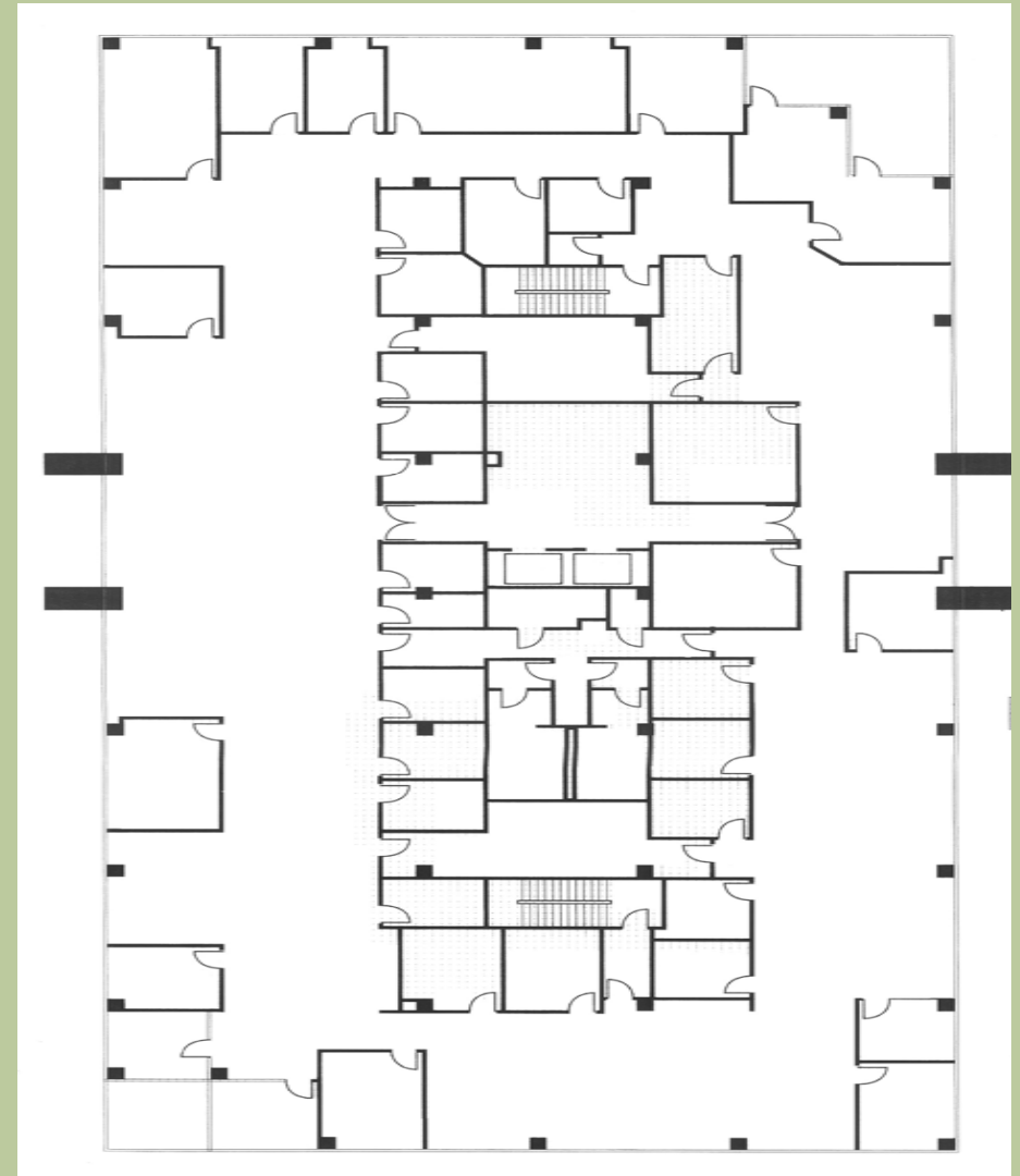
Third Floor Plan

JOHNSTON PACIFIC COMMERCIAL REAL ESTATE, INC.