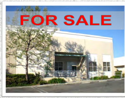
7,144 SF Freestanding Building